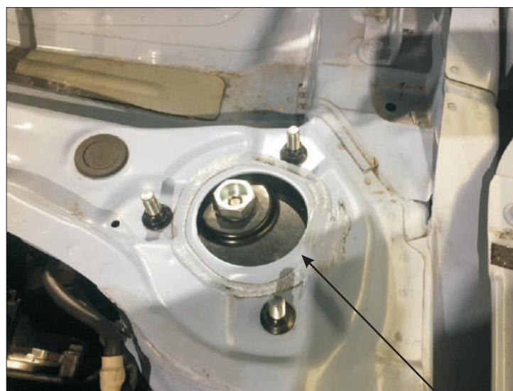
LH side shown - max camber caster

N.B: It is recommended that a licenced workshop or tradesperson carry out the above procedure and that workshop manual and relevant safety procedures are followed in addition to the above.